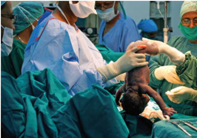
A recent delivery by caesarean section