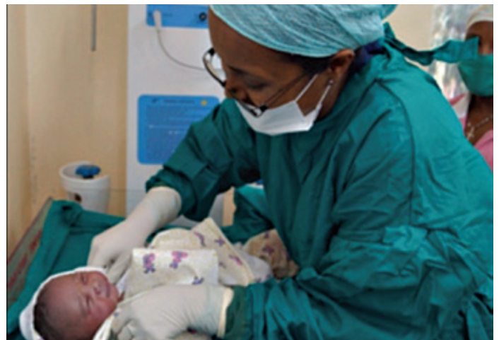
Tender care of theatre staff