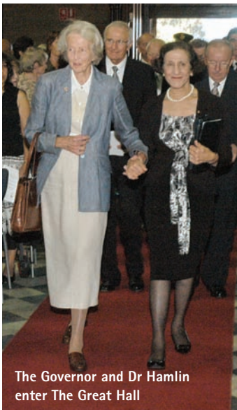
The Governor and Dr Hamlin enter The Great Hall

was greatly encouraged by the enthusiasm of so many people for our new midwifery college. Now at last through the generous support of our donors we are able to do something about preventing the terrible injuries suffered by women in obstructed labour.