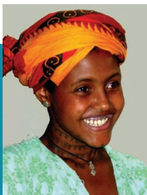
Dr. E. Catherine Hamlin

May God bless you all for your faithful support, without which this work will fail.