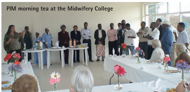
PIM morning tea at the Midwifery College