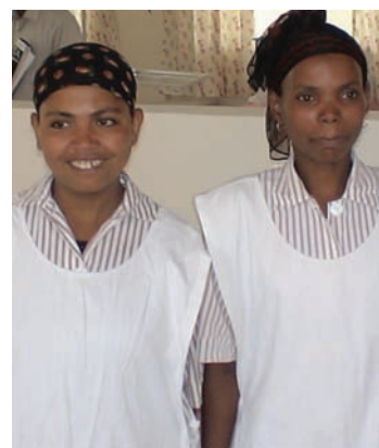
Nursing Aides at the new Harar Centre