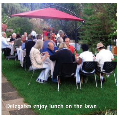
Delegates enjoy lunch on the lawn