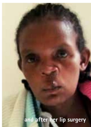
and after her lip surgery