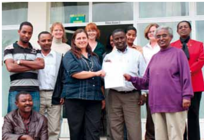
Midwifery College staff

So then, soon our fifth fistula centre will be opened in the town