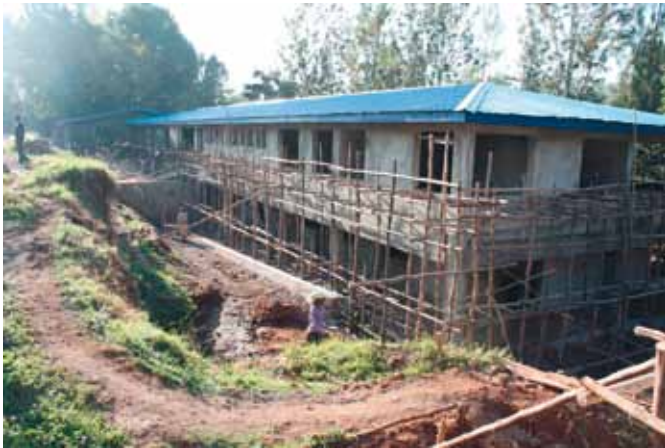
New Metu Centre

of Metu – in the remote far South/west province of Illubabor, where an enormous need awaits us.