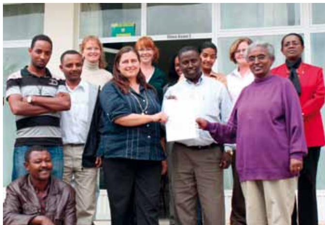
Midwifery College staff

So then, soon our fifth fistula centre will be opened in the town