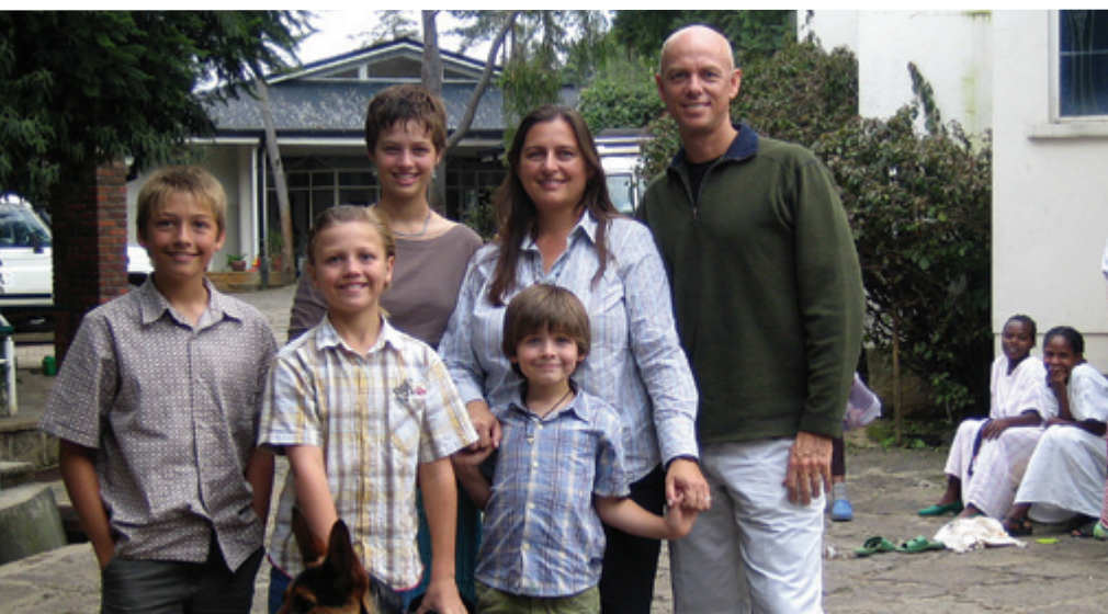
Bennett Family when they arrived in Ethiopia

iii. In prevention we have carried out evaluation meetings with our outreach workers to refocus our activities for better outcomes in patient location. We have worked with our first batch of deployed midwives and sent out our second batch, so that we now have 12 rural locations. In all of this we see the enormous challenge of improving maternal health and we renew our commitment to making a difference and preventing the injury of Obstetric Fistula.